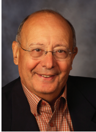
SENATOR/HON. ALFONSE D'AMATO

Wednesday, December 2, 2009 • 1:00 PM Long Island Marriott Hotel